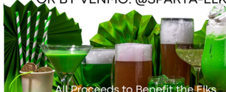
All Proceeds to Benefit the Elks Made with PosterMyWall.com